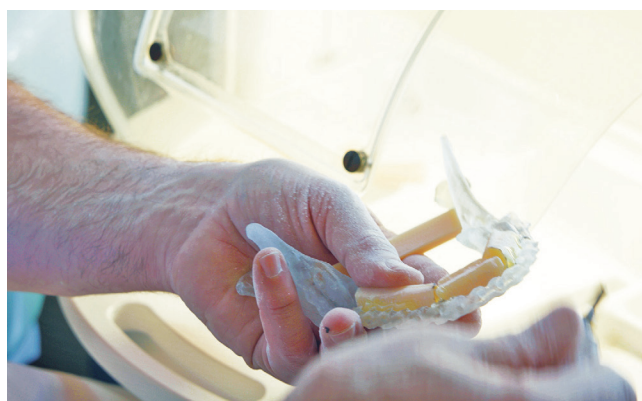
3D printed surgical guide produced on the Stratasys Objet260 Dental Selection 3D Printer.