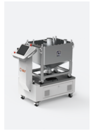
Powder Adding Machine BLT-GF300