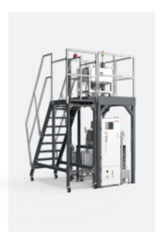
Powder Sieving Machine BLT-SF800