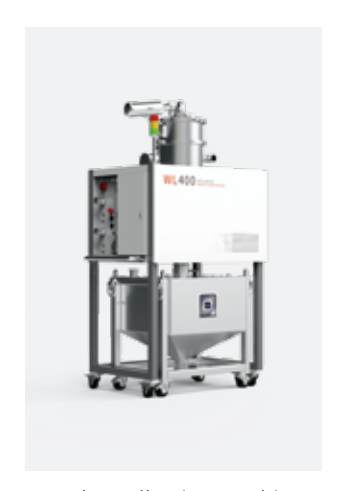
Powder Collection Machine BLT-WL400