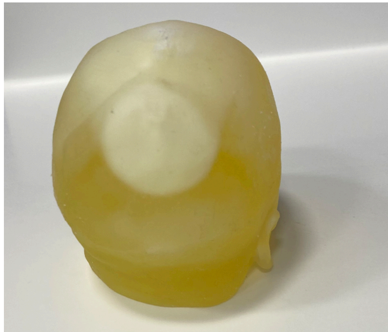
Craniosynostosis Prototype Model created using Bone Matrix and Tissue Matrix Material - Rear/Overhead View.