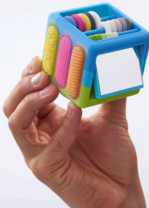
3D printed concept models can feature full-color, advanced textures and moving parts.

Leading consumer goods market leaders build in full-color, advanced textures and a broad range of material properties, including transparent and rubber, making the Stratasys J-Series Full Color 3D Printers an ideal solution for rapid prototyping in the fast-moving consumer goods market. The Stratasys J-Series Full Color 3D Printers maximizes uptime and the diversity of jobs that can be handled with one system, which means product developers and designers deliver realistic packaging prototypes faster, allowing for a more detailed evaluation sooner for key moments in the development process, such as client presentations, focus group and testing.