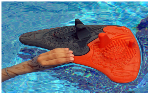
This fully functional 3D printed prototype was tested in real conditions and enabled AIJU to verify and validate the design fast.

For AIJU and others producing consumer goods, the ability to change designs easily without painstaking manual work eliminates costly intermediate prototype stages that can take weeks. In addition, printing batches of prototypes lets product engineers test multiple features, designs and improvements simultaneously, eliminating time-wasting when trying to perfect a client-ready presentation model one iteration at a time.