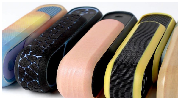
Test concept and fit with realistic, 3D printed prototypes.

With advanced colors and materials, your development cycle can now be accomplished in a single print. A 3D printer with true, full-color capabilities, texture mapping and color gradients creates prototypes that look, feel and operate like finished products, without the need for painting or assembly. In addition to color, advanced material properties ranging from rigid to flexible and opaque to transparent are also possible.