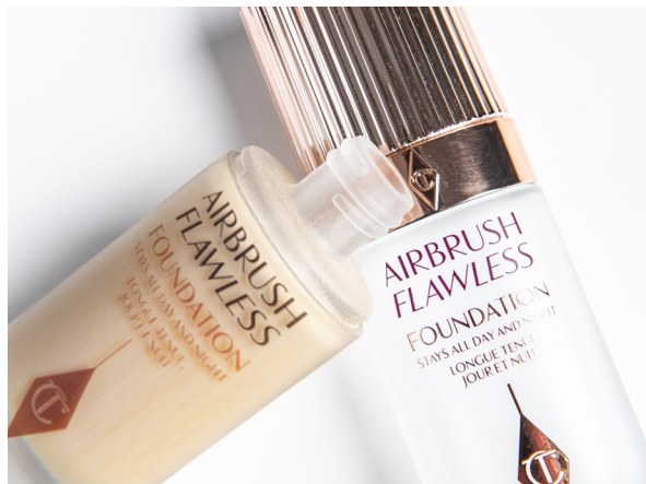
The GrabCAD Print™ slicer on the Stratasys J-Series Full Color 3D Printers makes it possible to simulate glass or transparent acrylic packaging containers alongside advanced textures and vivid colors.

For many top global brands, employing full-color, multi-material 3D printed prototypes across the product development is the key to rapid growth. Not only does the process help create a better product, it does so in less time while saving thousands of dollars. Many in the consumer goods