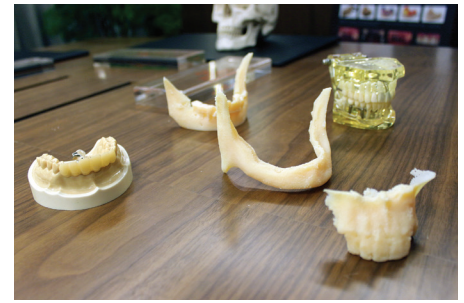
3D printed dental models used to test fitting of fixtures

"3D printing allows us to reproduce real-life conditions and create customized tools, helping us make the optimal decision for every patient and perform surgeries smoothly. Patients are better consulted on the treatment procedures and outcome, resulting in higher confidence and satisfaction," said Dr. Wu.