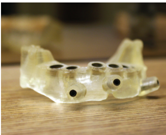
3D printed dental guides to accurately locate implants

The Sense & Beauty Dental Clinic (SBDC) in Taiwan is a one-stop dental center offering a range of comprehensive dental services to over 10,000 patients annually. Since its start in 2005, SBDC has emphasized the use of advanced technologies in diagnoses, dental treatments and training for practitioners.