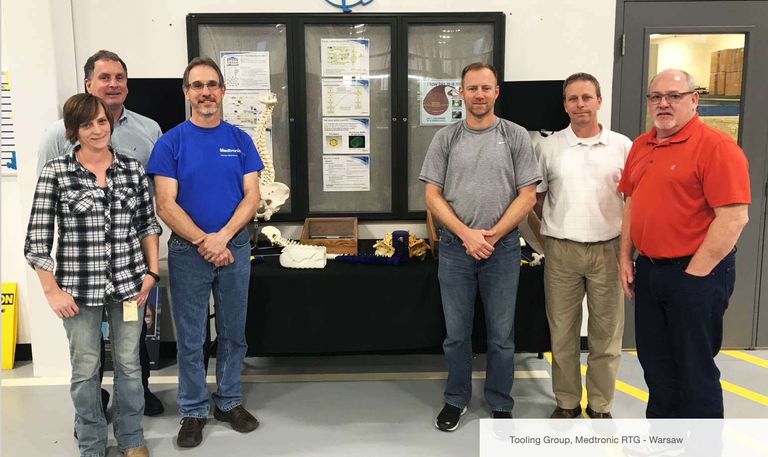
Tooling Group, Medtronic RTG - Warsaw