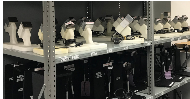
3D printed inspection gages.