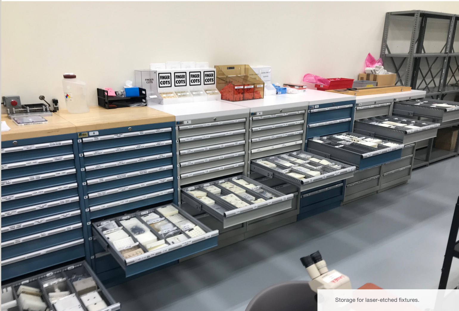
Storage for laser-etched fixtures.

For example, Booth says, "Lighter tools and jigs are easier to move — cutting the risk of repetitive strain injury for operators and making the process more efficient. And safer working conditions positively impact worker productivity." The bottom line: "3D printed tools enable custom designs to best fit the requirements of the user and the operation. Personalized tools are easier to use, boost productivity, and create a better working environment all the while reducing process time, improving efficiency and time to market."