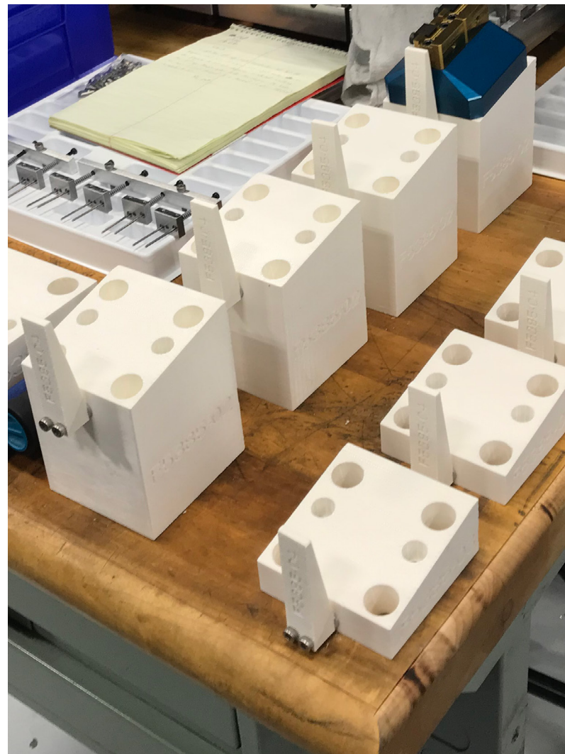
Workstation being outfitted with 3D printed tooling mounts and holders.

— whatever their complexity — through several iterations on demand, with ease. “Best of all,” according to Booth, “Complex geometries can be produced at no additional cost, whereas with machined jigs and fixtures we were often limited due to the high cost of production. For example, an FDM fixture that costs $1,000 to build internally could potentially cost $20,000 when machined on the outside. On average, we estimate FDM parts cost 80% less to produce when compared to machined parts. Over a four-year period we estimated a $6 million savings versus what would have been spent if we had contracted the parts to an outside machine shop.”